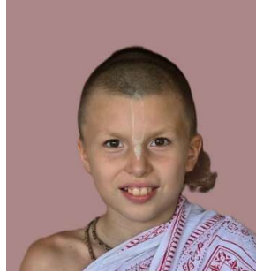
Samvit Grade 5