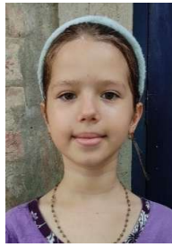
Panchali Grade 3